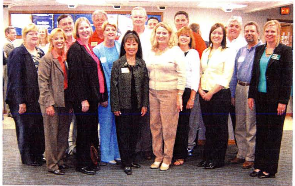
2006 Business-After-Hours Hosts

Chamber member. Business-After-Hours are the Chamber's largest monthly networking events and provide a way to meet new people, gather business leads and network with fellow Chamber members. The location varies from month to month as the event takes place at various member businesses around the county.